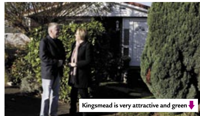
Kingsmead is very attractive and green ↓