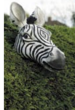
... and even a zebra! →

This 36ft x 20 Donnington (1978 model) is currently available for £120,000. It is a spacious three-bedroom property with an eye-catching garden. A similar detached bungalow in Wilby village would cost you around £165,000, a saving on the park home of £45,000.