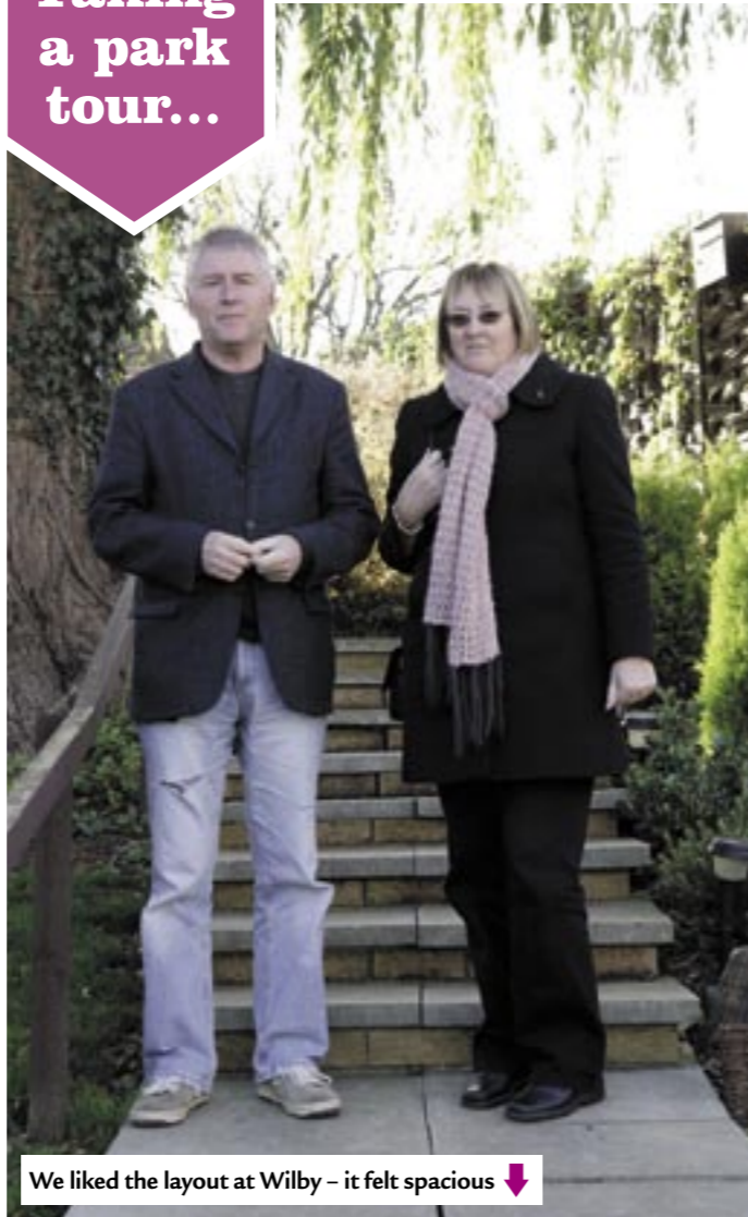
We liked the layout at Wilby - it felt spacious ↓