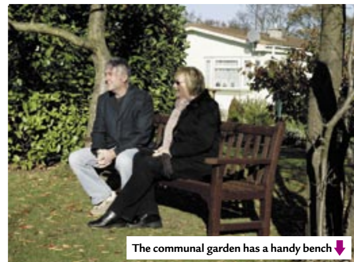
The communal garden has a handy bench ↓