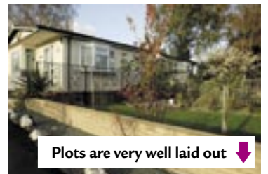
Plots are very well laid out ↓