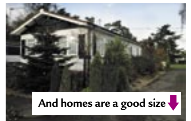
And homes are a good size ↓