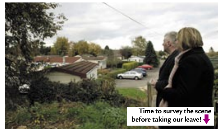
Time to survey the scene before taking our leave! ↓