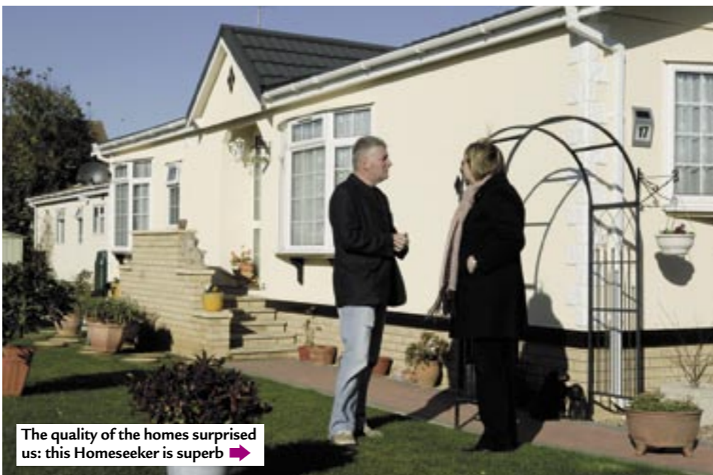
The quality of the homes surprised us: this Homeseeker is superb →