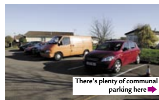
There's plenty of communal parking here →