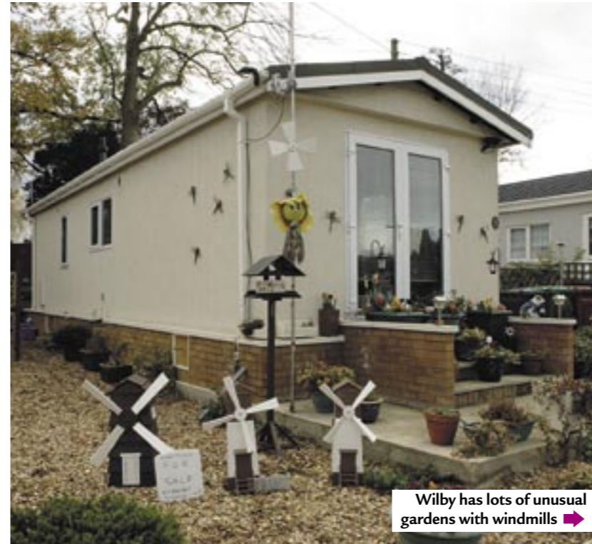
Wilby has lots of unusual gardens with windmills →