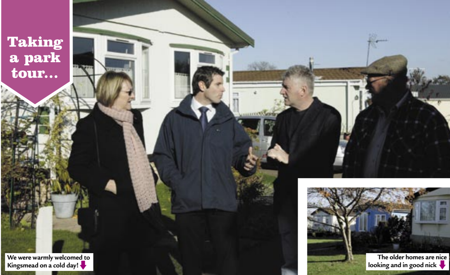
We were warmly welcomed to Kingsmead on a cold day! ↓