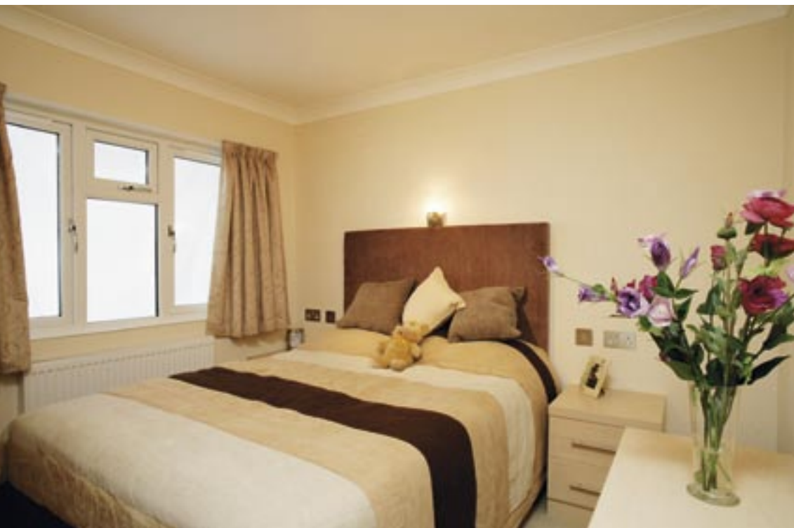
Above: The second bedroom is in the same style as the master