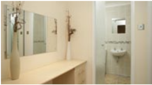
Above: The dressing area and en suite shower room