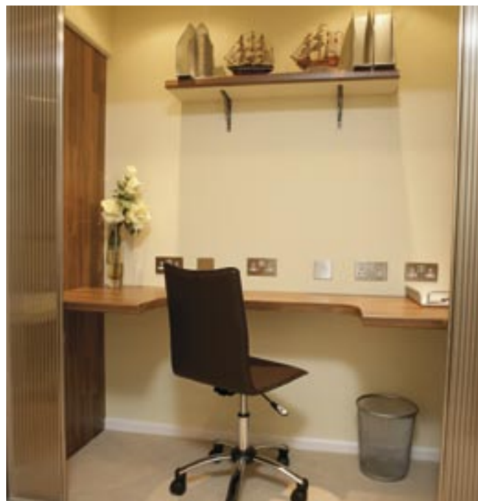
Left: A door from the hallway reveals this hidden gem. An office in a cupboard – a compact and practical workstation without having to sacrifice a bedroom

These doors neatly fold to the side to reveal a built-in desk, shaped to accommodate a computer with the necessary power points and phone connections on the wall behind, and a shelf above. There's room under the desktop for freestanding