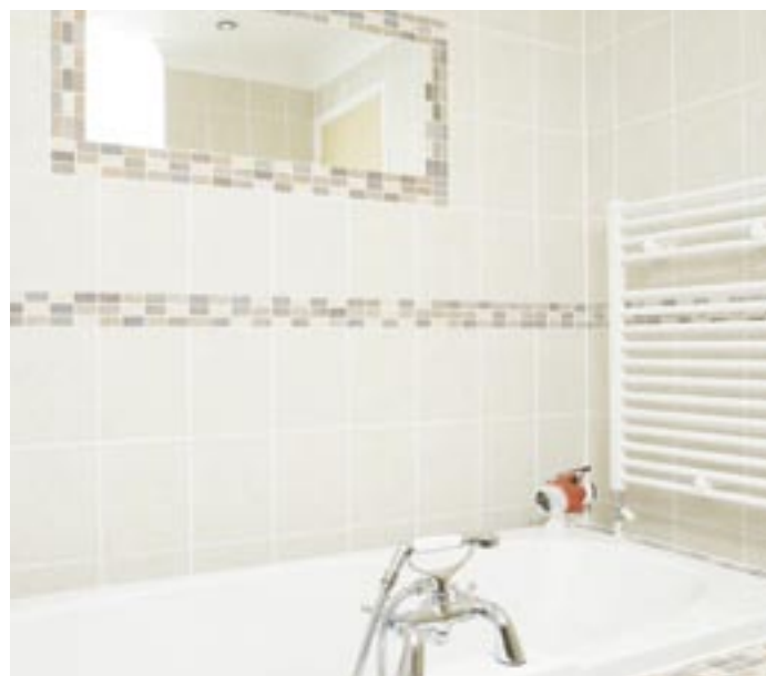
Above: The Haytor uses attractive feature tiles for the surround on the semi-sunken bath and for the mirror border above, too

shower area is across the whole width of this room, partly closed off by a screen and with a sloping