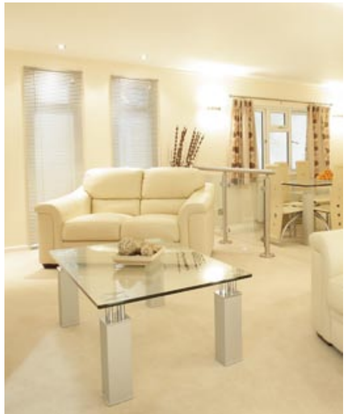
Above: Put your feet up on one of the comfy settees. Shoes off please!