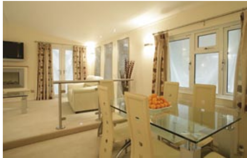
Above: To create consistency and a flow through the home, the glass-top dining table is the same style as the coffee table in the lounge