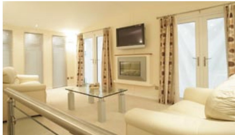
Above: The large lounge spreads across the whole width of the Haytor